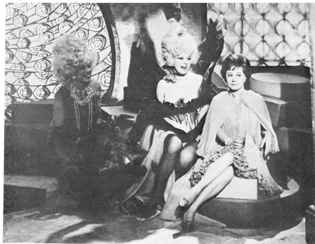
Fellini's Giulietta degli Spiriti

tone them down. One of the most rigorous examples of toning-down is Red Desert: in most scenes Antonioni chooses settings and lighting conditions which make all colors tend toward gray. A milder case is The Bible , in which Huston carefully avoids any chromatic resemblance to other films based on the same book.