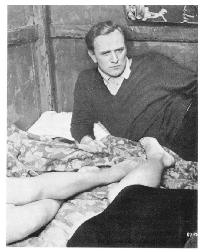
Antonioni's RED DESERT

to a particular wavelength of light emitted, reflected, or refracted by the object.