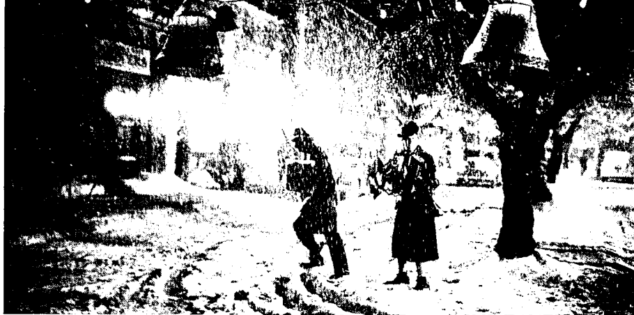
IT'S A WONDERFUL LIFE . Above: Small-town bucolic. Below: Small-town film noir.

One of the main ideological and thematic tensions of IT'S A WONDERFUL LIFE is beautifully encapsulated in the scene in which George Bailey (James Stewart) and Mary (Donna Reed) smash windows in a derelict house as a preface to making wishes. George's wish is that he shall get the money to leave Bedford Falls, which he sees as humdrum and constricting, and travel about the world; Mary's (not expressed in words, but in its subsequent fulfillment—confirming her belief that wishes don't come true if you speak them) is that she and George will marry, settle down and raise a family, in the same derelict house, a ruined shell which marriage-and-family restores to life.